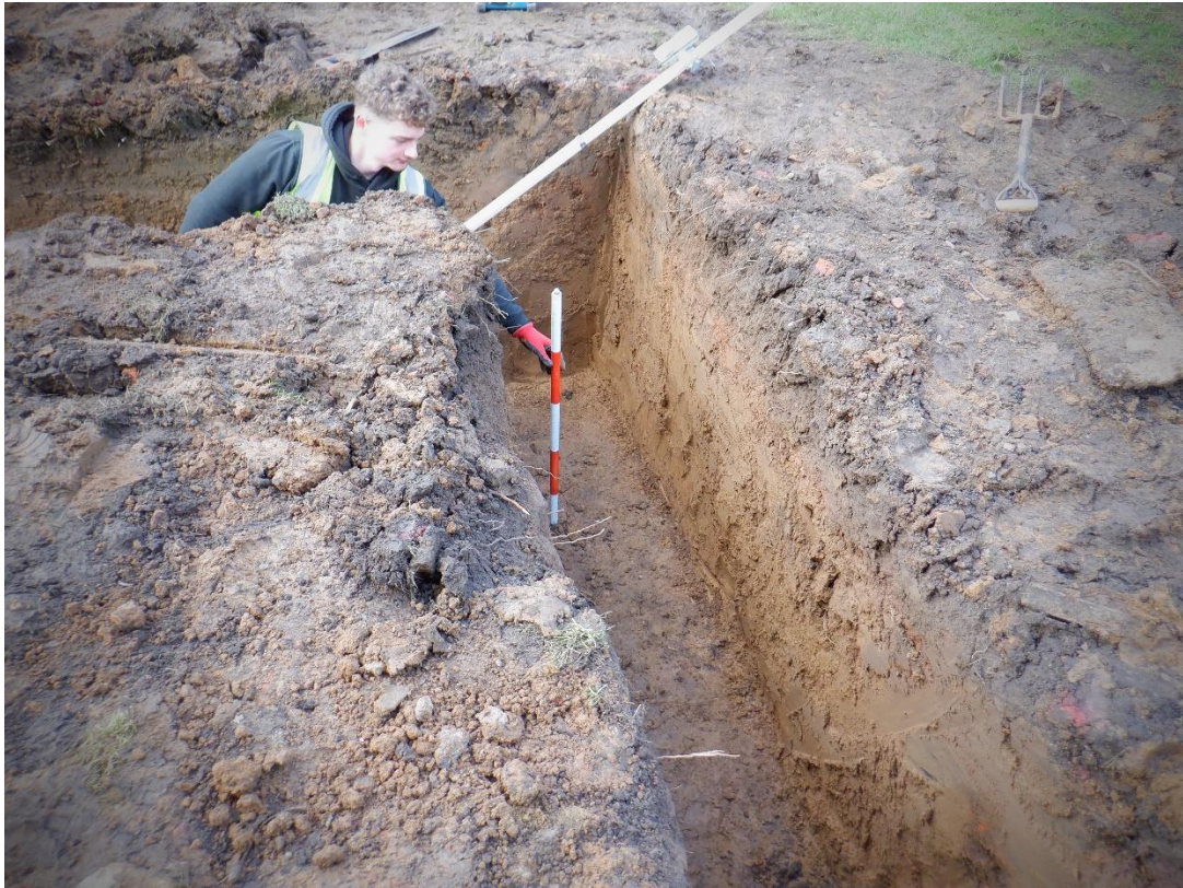
Plate 5. Foundation trenches progressing (Looking West)