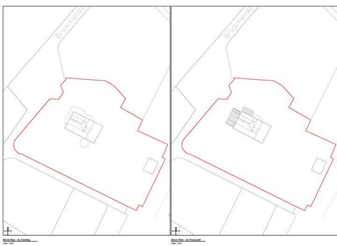
Figure 1. Existing and proposed