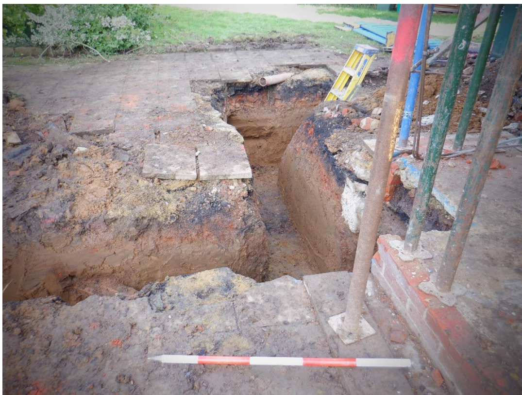
Plate 4. Foundation trenches (Looking North)