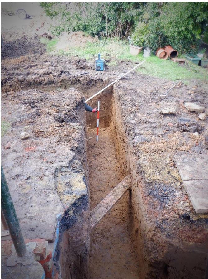
Plate 6. Foundation trenches (Looking NE)