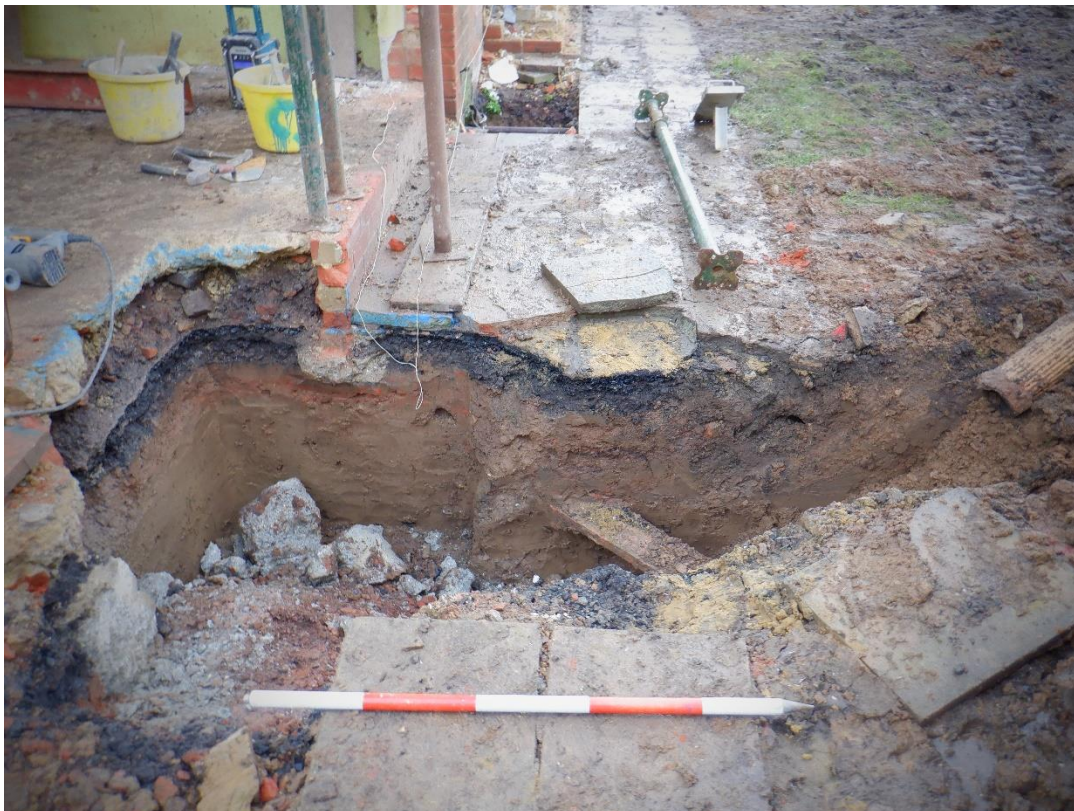
Plate 2. Start on proposed foundations (looking East)