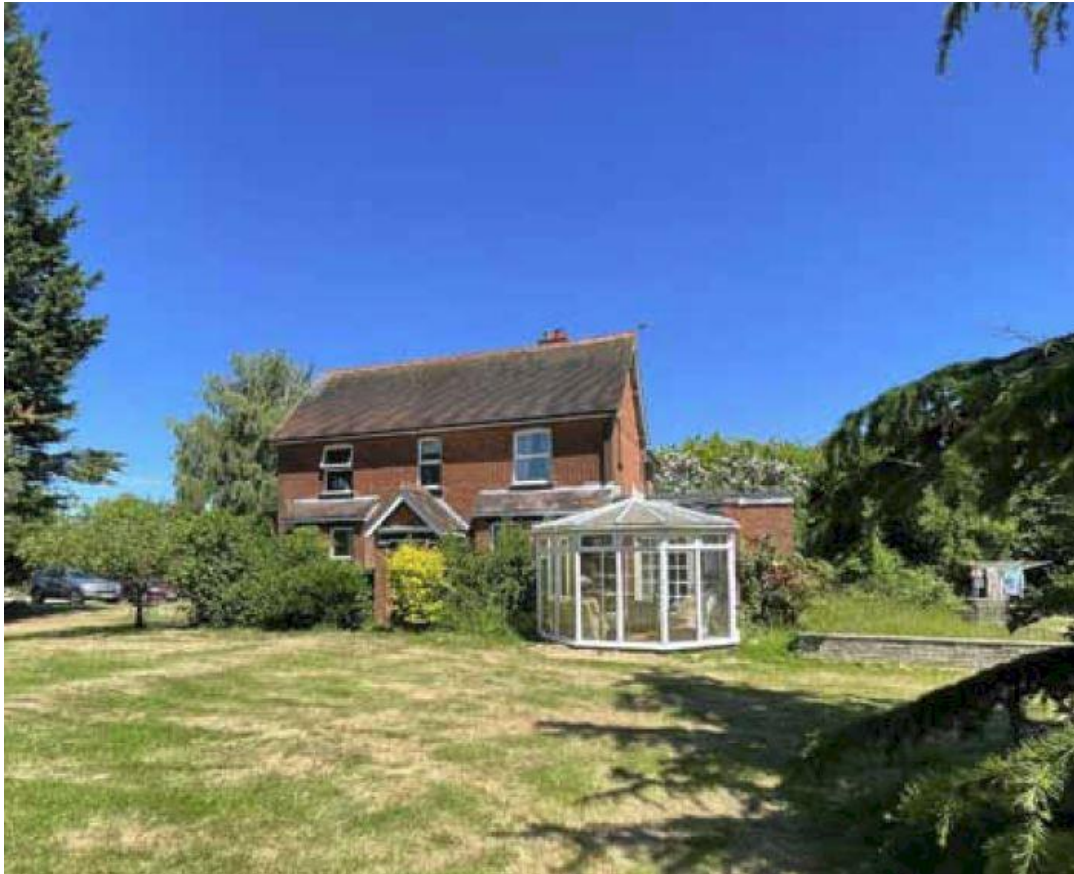
Plate 1. Prior to redevelopment (looking SE)