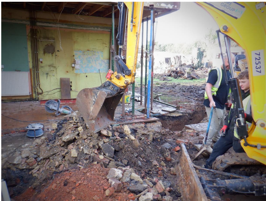
Plate 3. Demolition of floor slab (Looking South)