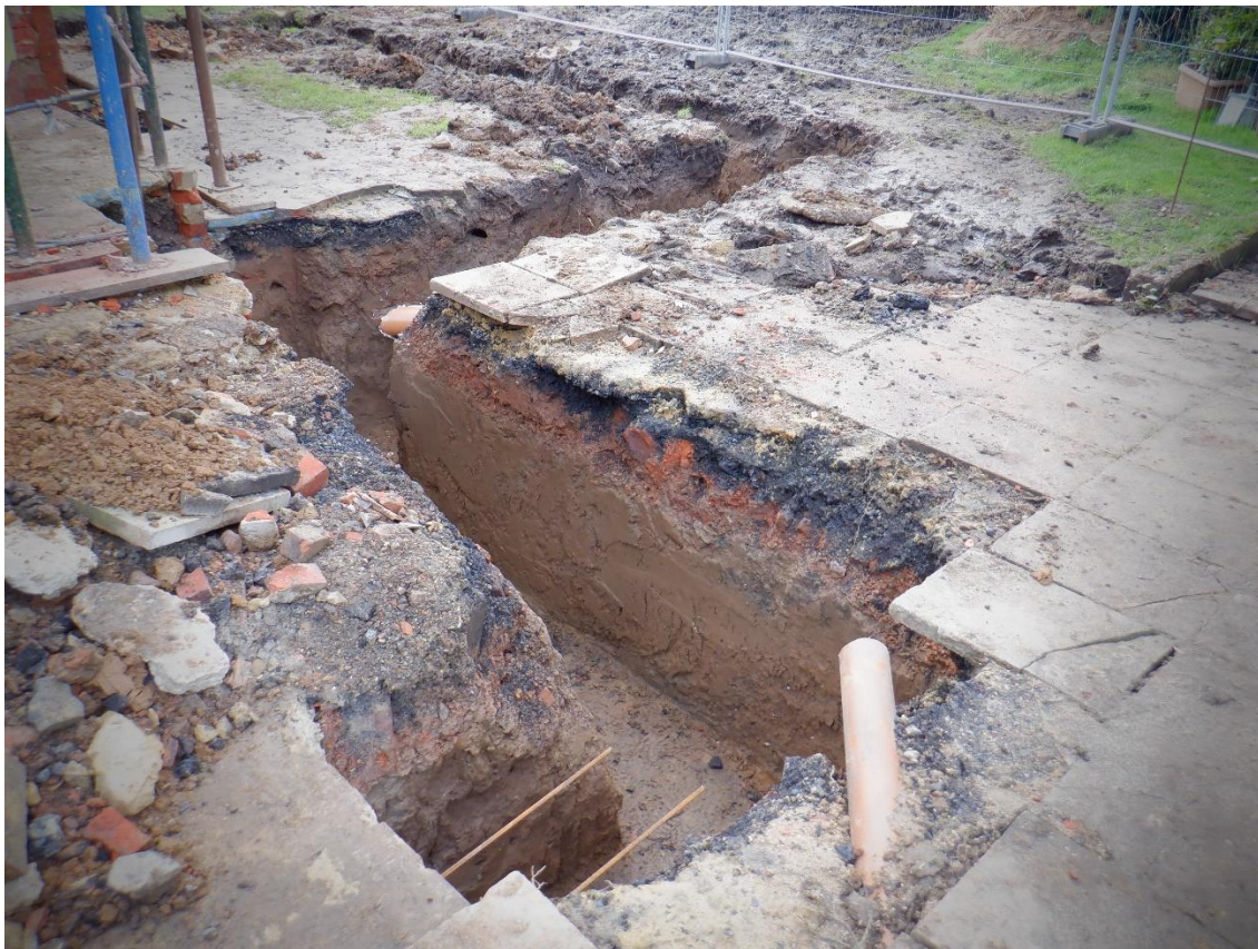
Plate 8. Completed foundation trenches (Looking SE)