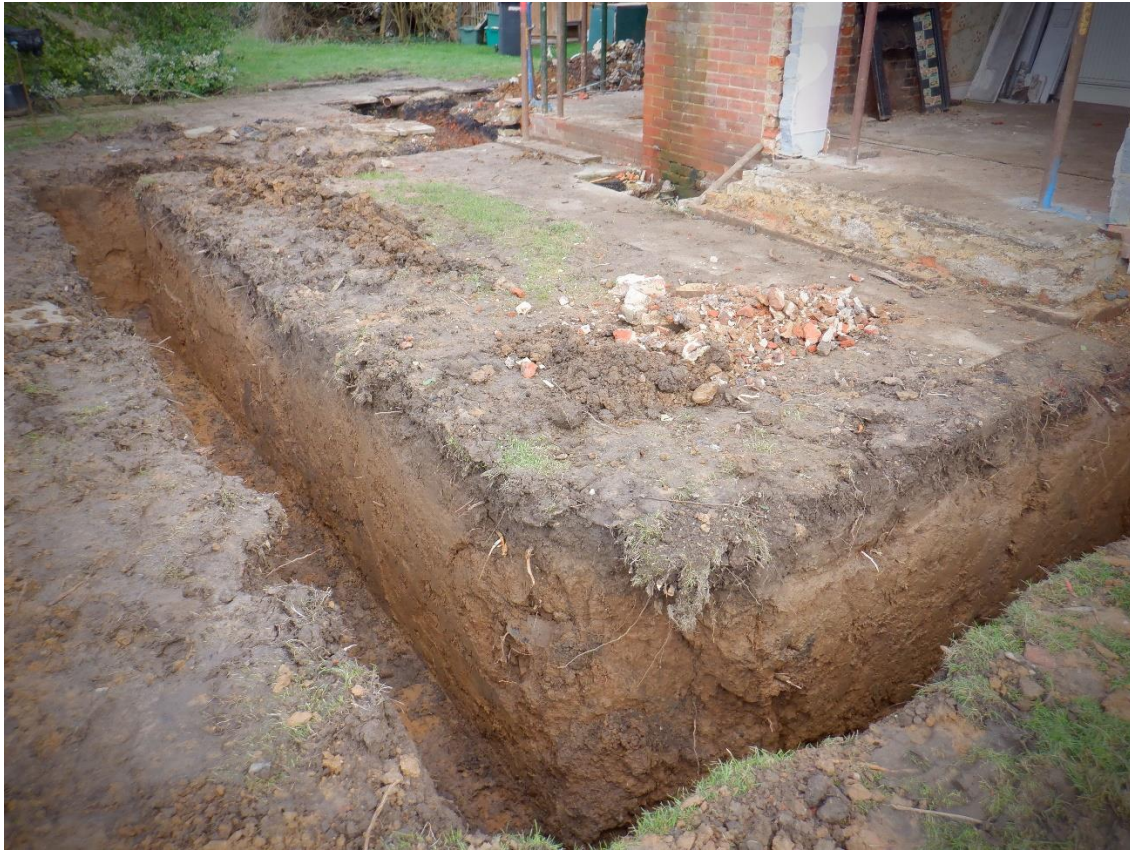
Plate 7. Completed foundation trenches (Looking NE)